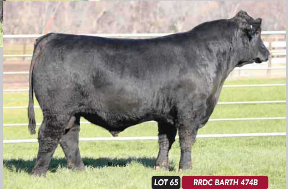
LOT 65 RRDC BARTH 474B