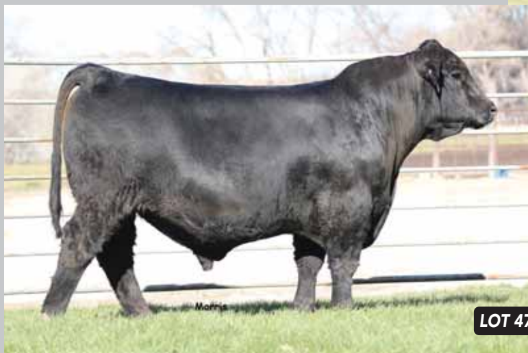
LOT 47 RRDC BIG WIN 579B