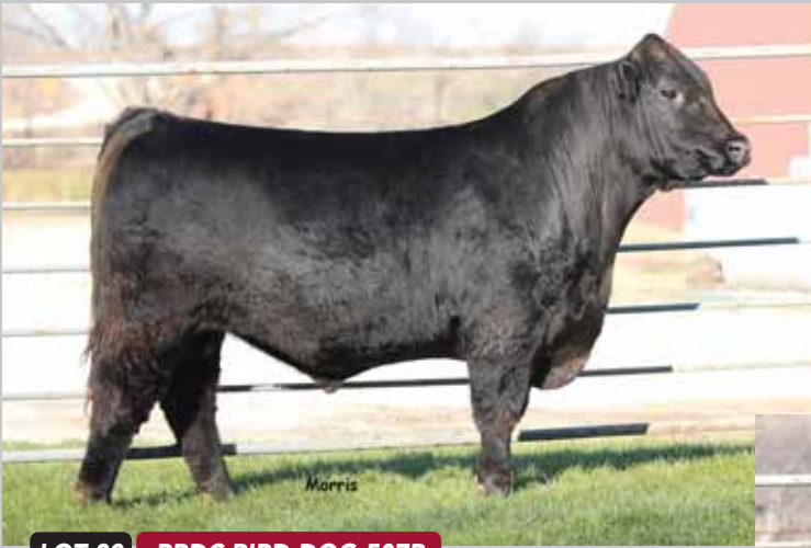
LOT 22 RRDC BIRD DOG 507B