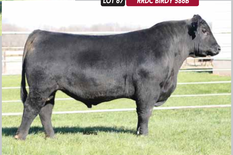
LOT 67 RRDC BIRDY 586B