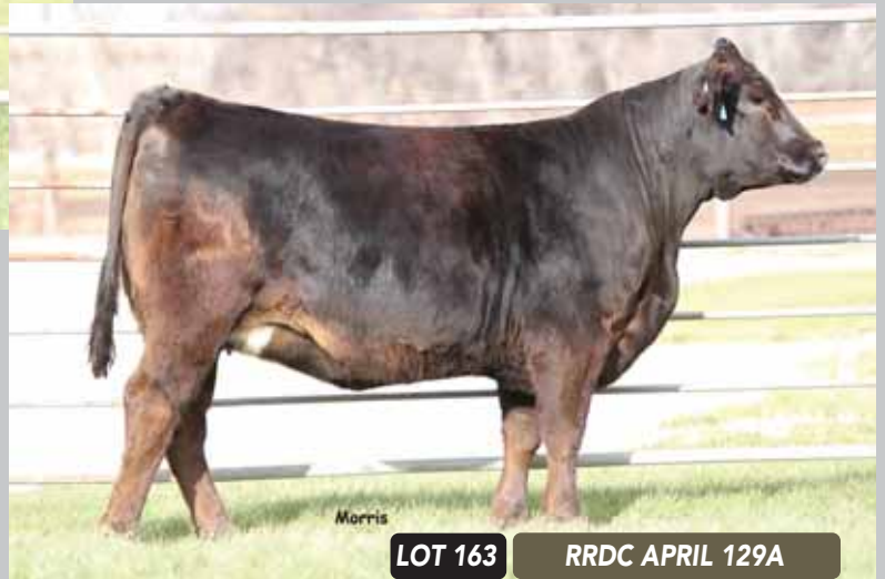
Morris LOT 163 RRDC APRIL 129A