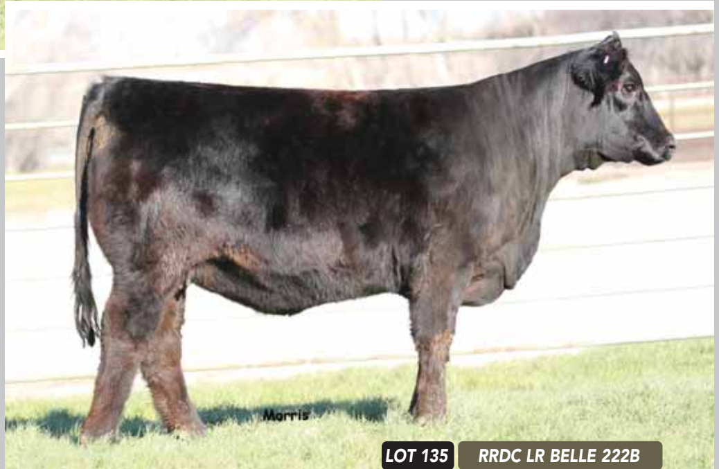
LOT 135 RRDC LR BELLE 222B