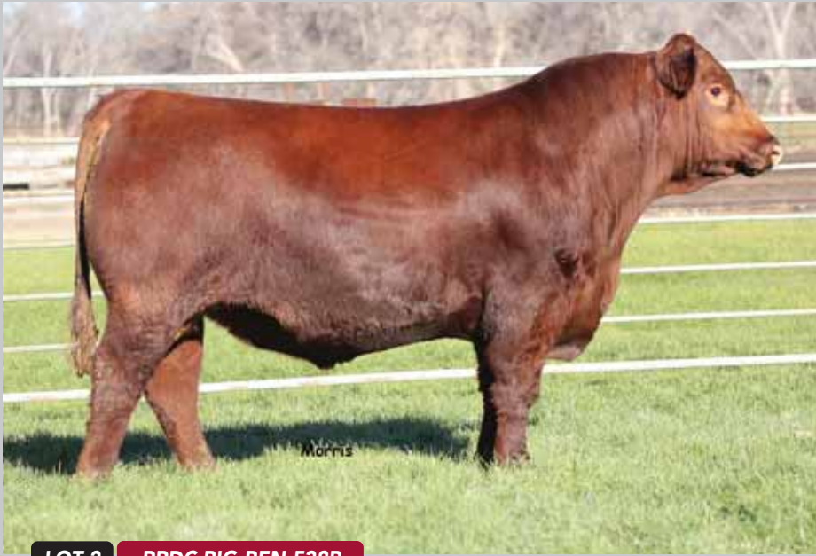
LOT 2 RRDC BIG BEN 538B