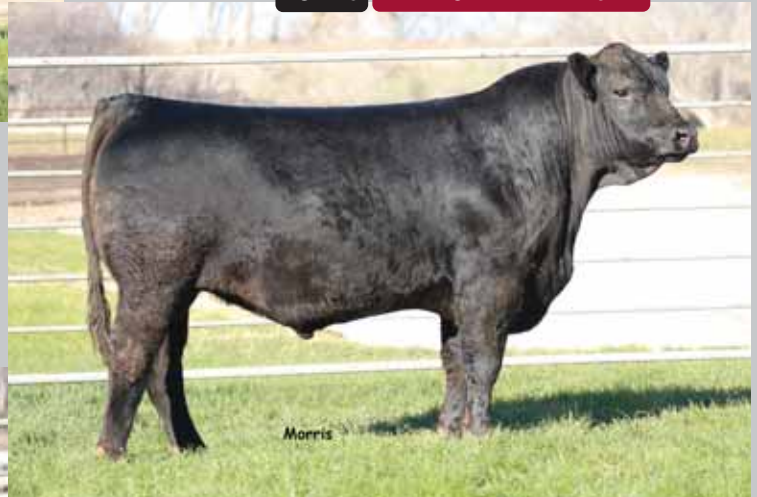
LOT 23 RRDC BAXTER 475B