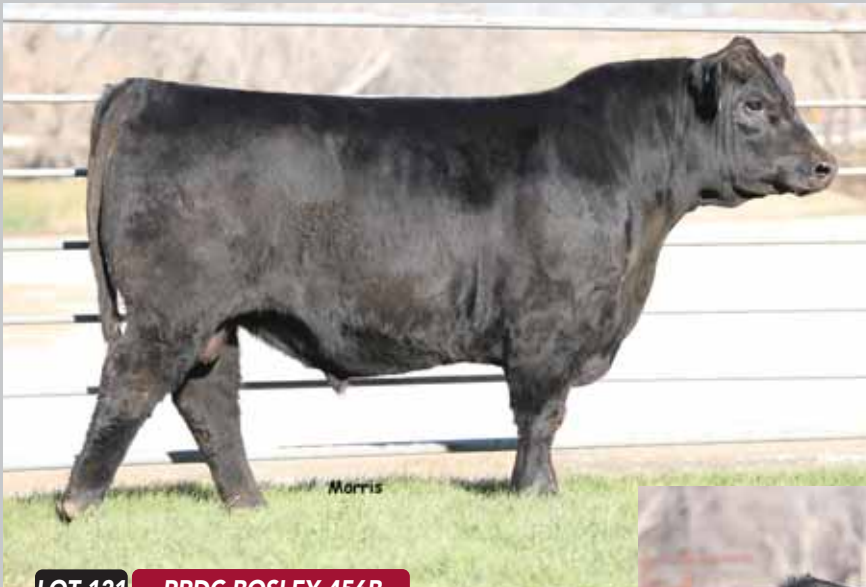
LOT 121 RRDC BOSLEY 456B