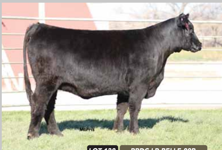
LOT 138 RRDC LR BELLE 89B