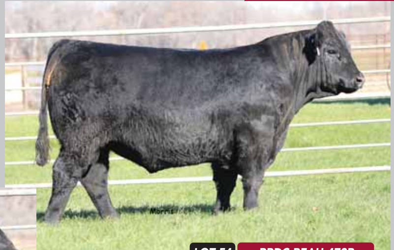
LOT 54 RRDC BEAU 478B