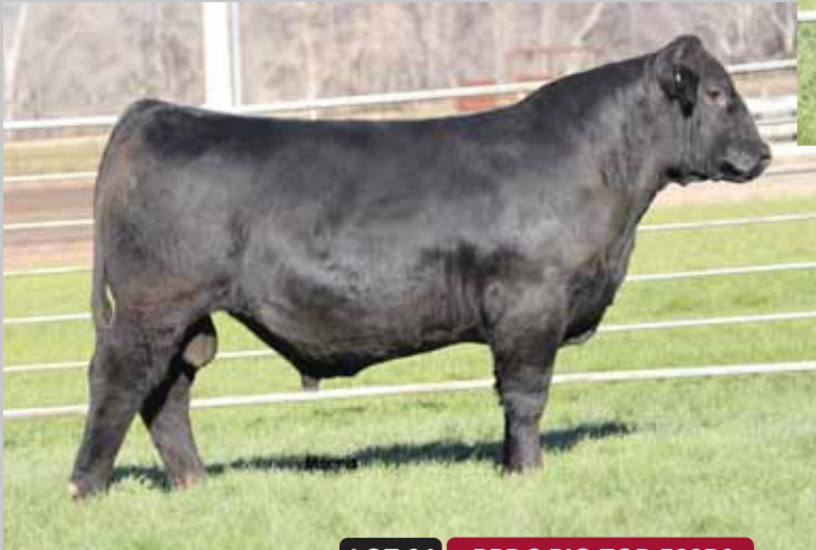
LOT 24 RRDC BIG TOP 583B