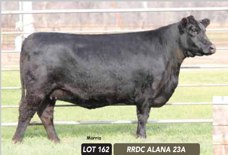
Morris LOT 162 RRDC ALANA 23A