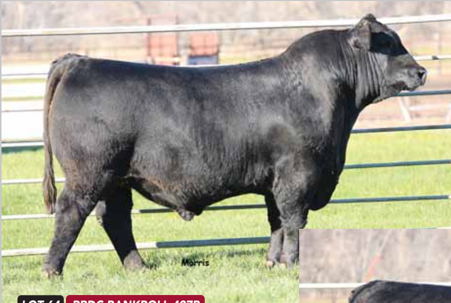
LOT 64 RRDC BANKROLL 497B