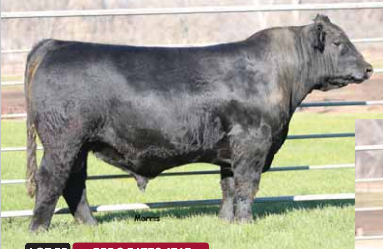
LOT 55 RRDC BATES 476B