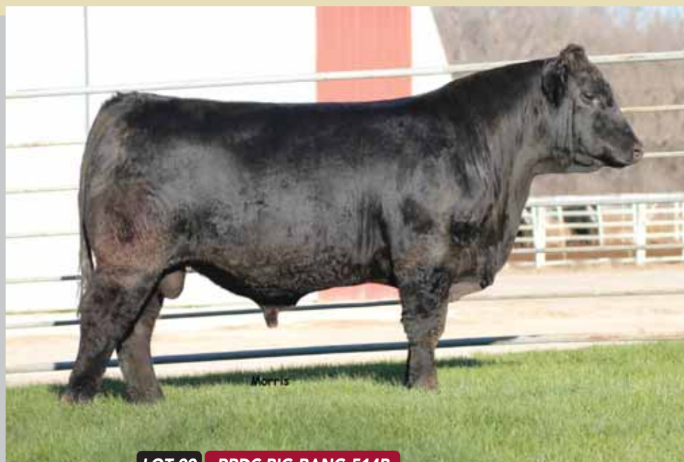
LOT 99 RRDC BIG BANG 514B