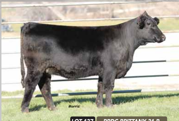
LOT 137 RRDC BRITTANY 31 B