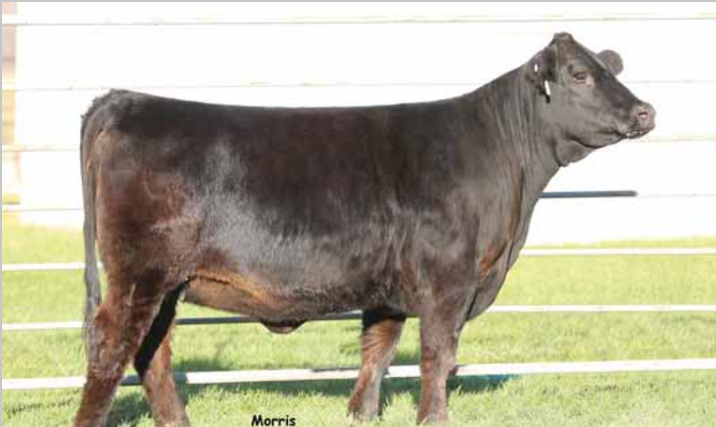
LOT 134 RRDC LR BELLE 155B