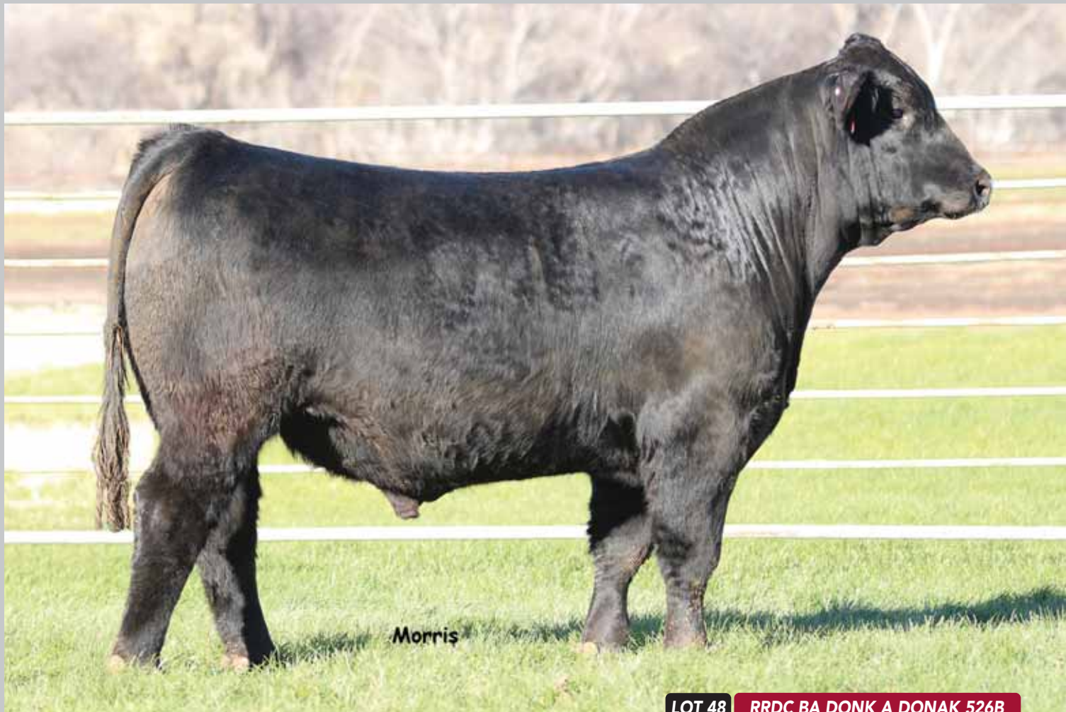
LOT 48 RRDC BA DONK A DONAK 526B