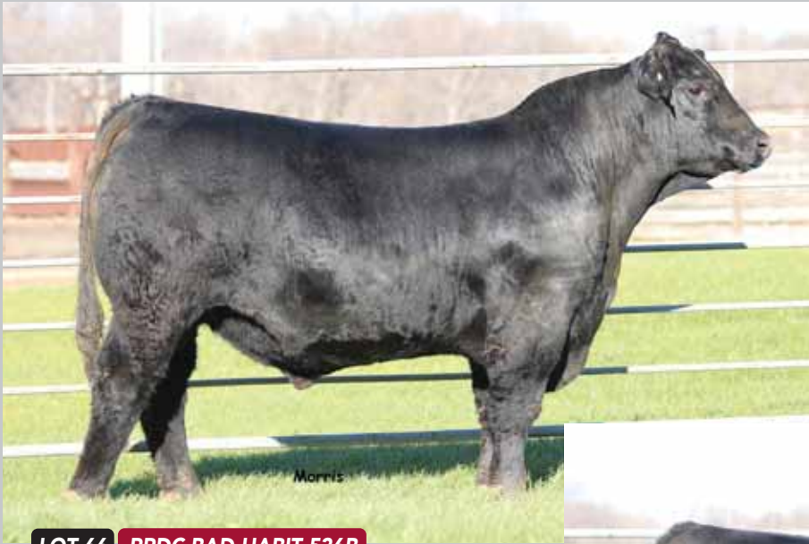
LOT 66 RRDC BAD HABIT 536B