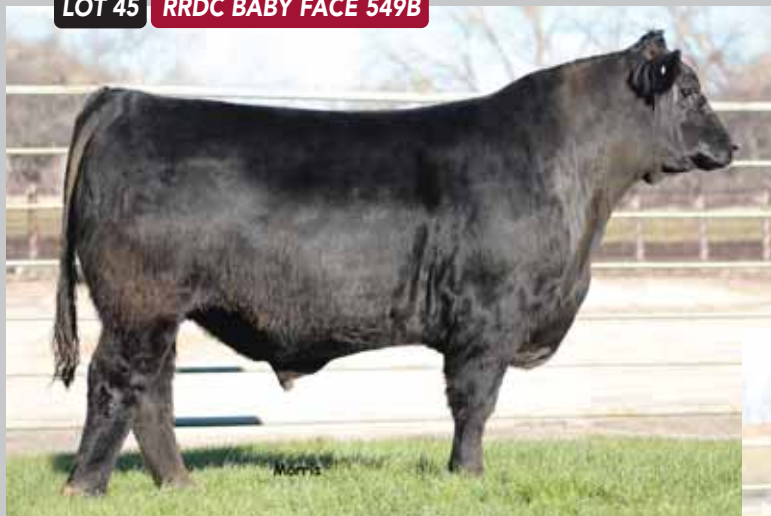
LOT 45 RRDC BABY FACE 549B