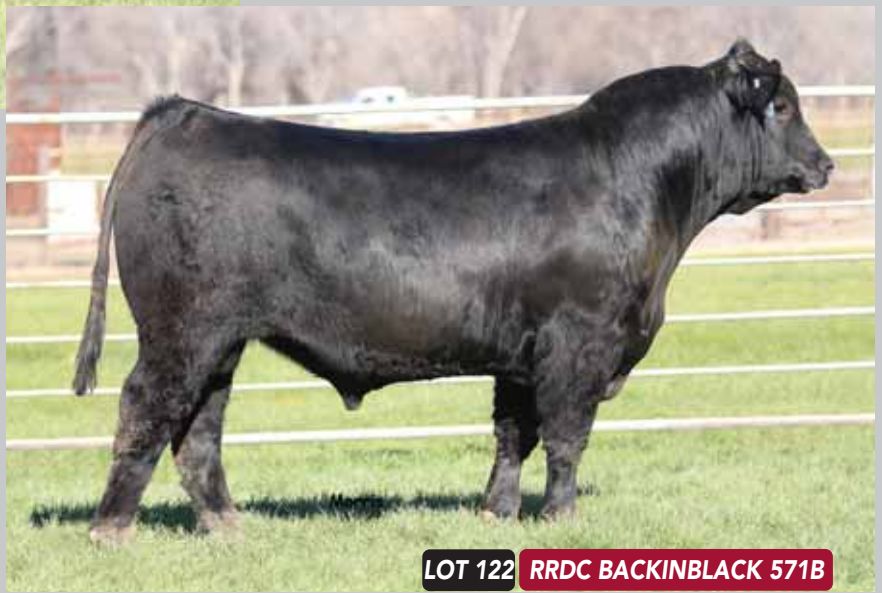
LOT 122 RRDC BACKINBLACK 571B