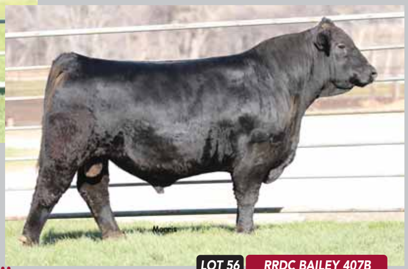
LOT 56 RRDC BAILEY 407B